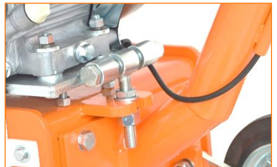
Belt tensioning device, allows to adjust the belt stress and eventually to replace the belt without removing the engine from its own seat