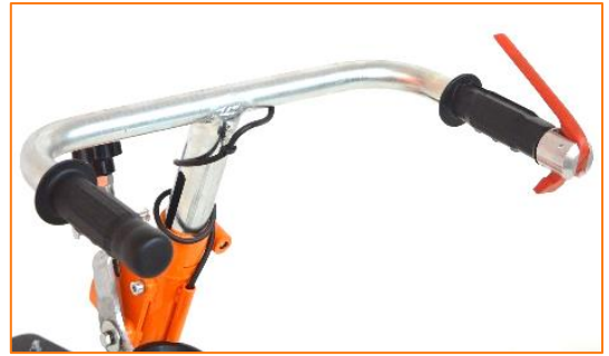
Engine shut-off safety device if operator leaves the handlebars