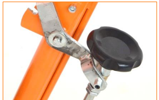
Millimeter regulator to adjust the height of the cutters from the ground