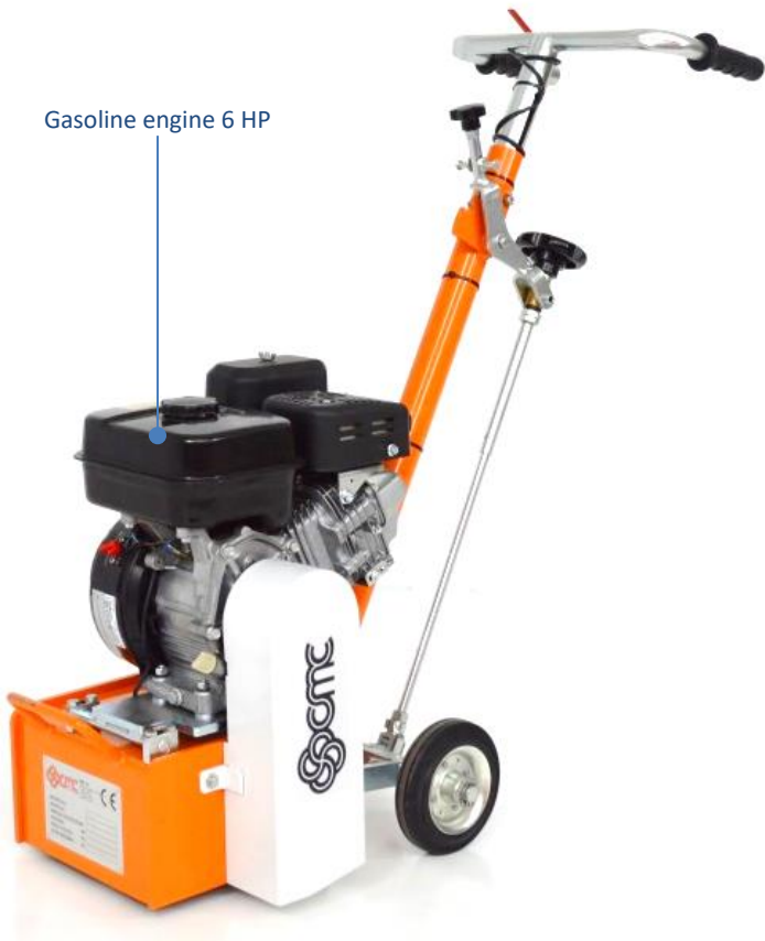
Gasoline engine 6 HP